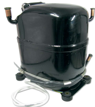
FCHK heating belt fitted on a compressor